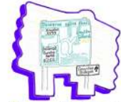
Thornton Heath Pond