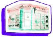
Gina Hair & Beauty