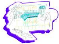
Croydon University Hospital