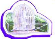
Ibis Styles Hotel