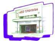
West Croydon Station

We'll be kicking off our trail at the south end of the road, at West Croydon Station, and working our way up to Norbury. Can you plot the landmarks on the map? Link the illustrations to the filled-in orange dots with an arrow. The orange circles filled with white are additional stops we'll make on the audio tour.